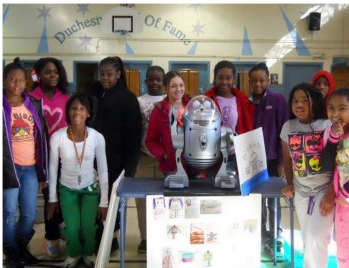
Robotics students at the Saturday celebration at Duchesne School